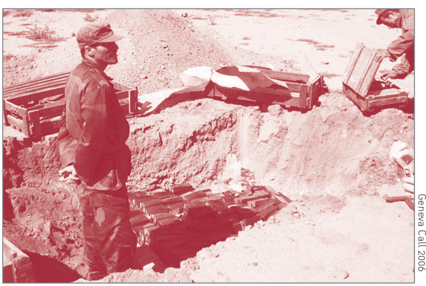
Members of the Polisario Front mine action team preparing for a stockpile destruction

Action UK, local organizations and the general public. The Polisario mine action team destroyed 140 mines in a test destruction on 26 February 2006 before proceeding to destroy 3,176 mines (including 144 AV mines) in the stockpile destruction event on 27 February.<sup>230</sup> The team had received expert input on preparations for the destruction from NPA (facilitated by Geneva Call),<sup>231</sup> UNMAS and Landmine Action UK. International experts were permitted to visit the destruction site before and after the demolition. An ambulance was present during the stockpile destruction, in accordance with international standards. Destruction of the remaining stocks is also anticipated, and a second destruction is foreseen for late 2006.