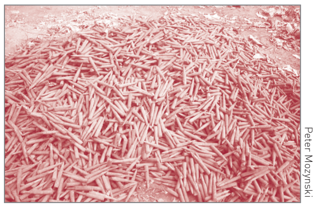
Ammunition rounds, South Sudan

Although not expressly mentioned by any of the informants, it would appear that involving NSAs in mine action also is an effective confidence-builder, not only between the parties to conflict, but also between the NSAs and humanitarian organization(s). For example, NSA involvement in mine action has subsequently led NSAs to open up their stocks to destruction (even of other weapons), or to allow for the collection and destruction of small arms.<sup>149</sup> In this way, mine action could work as a potential enhancer of disarmament.