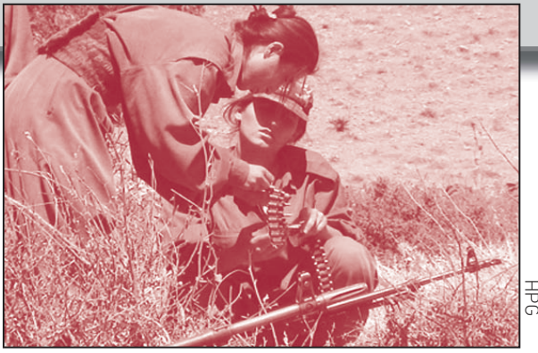
Women combatants of the People's Defense Forces

Volume I defined an NSA as any armed actor with a basic structure of command operating outside state control that uses force to achieve its political or allegedly political objectives.<sup>33</sup> Such actors include rebel groups and governments of entities which are not (or not widely) recognized as states.<sup>34</sup> It is apparent that NSAs (also called non-state armed groups or simply armed groups) are very diverse. Some of these groups may have clearly defined political objectives, while this may be less clear-cut in other cases. Some NSAs may control territory and have established administrative structures parallel to those of the state, while others have loose command structures and weak control over their members. Some concentrate their forces on attacking military targets, while others attack civilians. They can be composed of men, women, and children. In some groups, female members are estimated to comprise one-fifth or even one-third of the recruits to the group's combatants and other members.<sup>35</sup> Members of these groups may have been recruited voluntarily or forcefully. Certain NSAs allegedly even provide services that aim at protecting the human security needs of their members, such as "social or psycho-sociological needs."<sup>36</sup> Mine action can also be such a service.