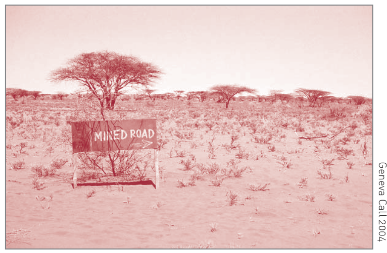
Mined road marked by SOMER

In the Bay and Bakool regions, the local NGO, Baharsaf Cut the Mine Organization (BCMO, affiliated with the RRA), has conducted limited and ad hoc demining, along with some marking and information sharing. Even though the RRA does not possess any maps or records of minefields, the group (and BCMO) allegedly has knowledge of the suspected mine-affected areas.<sup>345</sup> Reportedly BCMO reopened access to six roads by removing approximately 70 mines.<sup>346</sup> However, BCMO is in serious need of technical know-how and appropriate equipment.