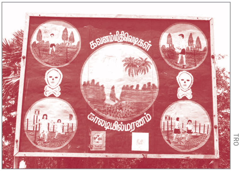
Sign by TRO and UNICEF warning for the dangers of landmines

There are several national and international MRE NGOs operating in Sri Lanka. White Pigeon (a sub-organization of the TRO) is one of the local NGOs with which UNICEF is implementing major MRE programs.<sup>476</sup> Three main operators work in all contaminated areas: (i) UNICEF<sup>477</sup> (in cooperation with UNDP Mine Action); (ii) White Pigeon; and (iii) Sarvodaya.<sup>478</sup> In the Vanni region, which is controlled by the LTTE, MRE is undertaken by White Pigeon and MAG, working closely with HDU.<sup>479</sup> Other substantial contributions come from local NGOs such as the Community Trust Fund and the Tamil Refugee Rehabilitation Organization.<sup>480</sup> MRE strategies have included community-based initiatives, mass media campaigns and school-based programs. Community liaison work is also undertaken,<sup>481</sup> especially by MAG.