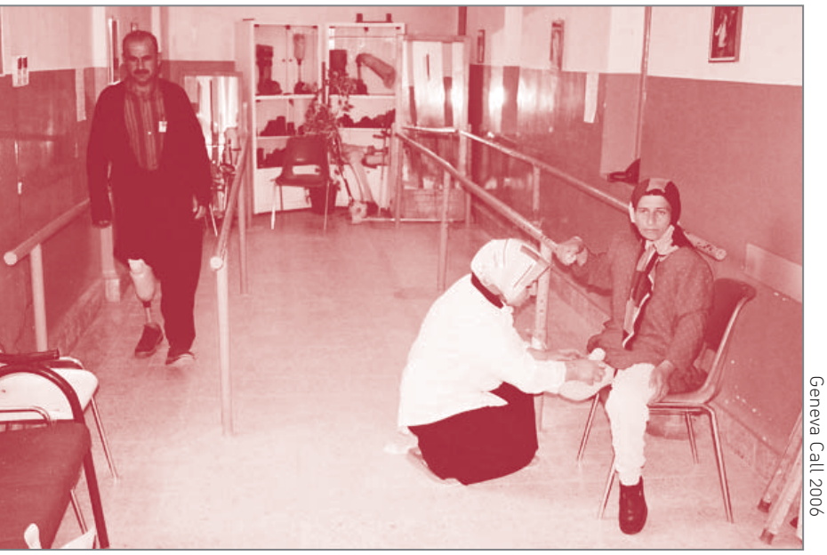
Rehabilitation of survivors in at the KORD \ensuremath{\mathsf{Orthopedic}} and \ensuremath{\mathsf{Rehabilitation}} Center in Sulaymaniyah

Rehabilitation services in Dohuk, Erbil, Sulaymaniyah and Halabja are run by national and international NGOs in cooperation with the regional Ministry of Health. International NGOs and organizations that support or run the centers include the ICRC and Emergency. The regional Ministry of Health finances at least two centers on its own.<sup>523</sup> HI has been present in the Sulaymaniyah region since 1991, responding to the needs of people with amputations in the region (most caused by AP mines). Centers which also manufacture prostheses were created in Sulaymaniyah and Halabja, and smaller centers were set up in the towns of Penjwin, Kalar<sup>524</sup> and Raniya.<sup>525</sup> In 2004, HI handed the entire program over to the local NGO, KORD. The prostheses provided by KORD are manufactured in Iraqi Kurdistan. All services are free-of-charge and the organization assists both the survivors and their families. KORD is active mainly in the area around Sulaymaniyah, but also provides services to people from Iran. Services include transportation, food and accommodation. KORD obtains its main resources from the regional authorities, through the General Directorate for Mine Action, and from the government of the Netherlands.<sup>526</sup> Medical assistance is covered by the regional government, but not transport to the hospitals. NPA has also covered transportation.<sup>527</sup>