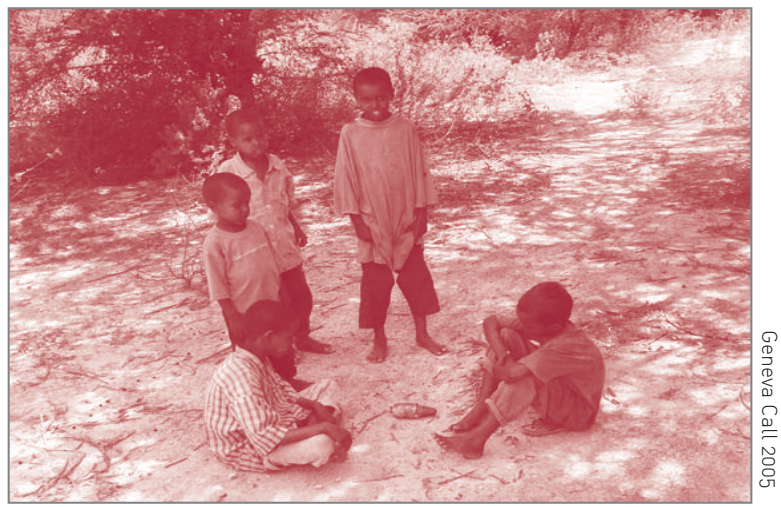
Children fascinated by UXO, Bardale district, Bay province, Somalia, May 2005