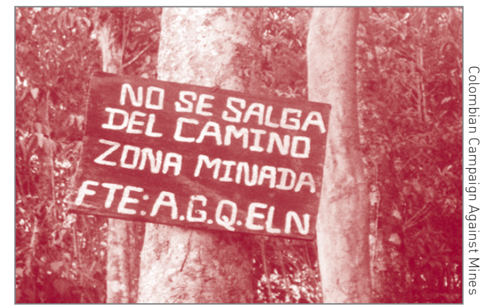
Sign placed by the ELN to warn the population of the presence of mines

Members of the ELN who are responsible for producing and placing landmines are also believed to deal with the removal of mines. However, the ELN appears to possess little knowledge of international standards for mine action. Female combatants are reportedly involved in both handling explosives and mine action (e.g. marking and informing about the presence of mines).<sup>37</sup>