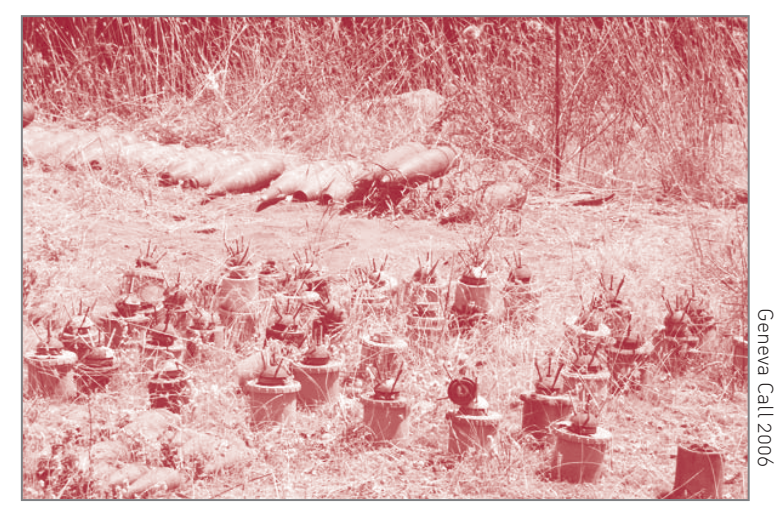
Mines and UXO lifted by HAR-PAR

There have been reports (from 1999) of one case in which the HPG unilaterally informed a mine action operator (tasked to remove booby-traps placed by the HPG) of the number of devices there were.<sup>406</sup>