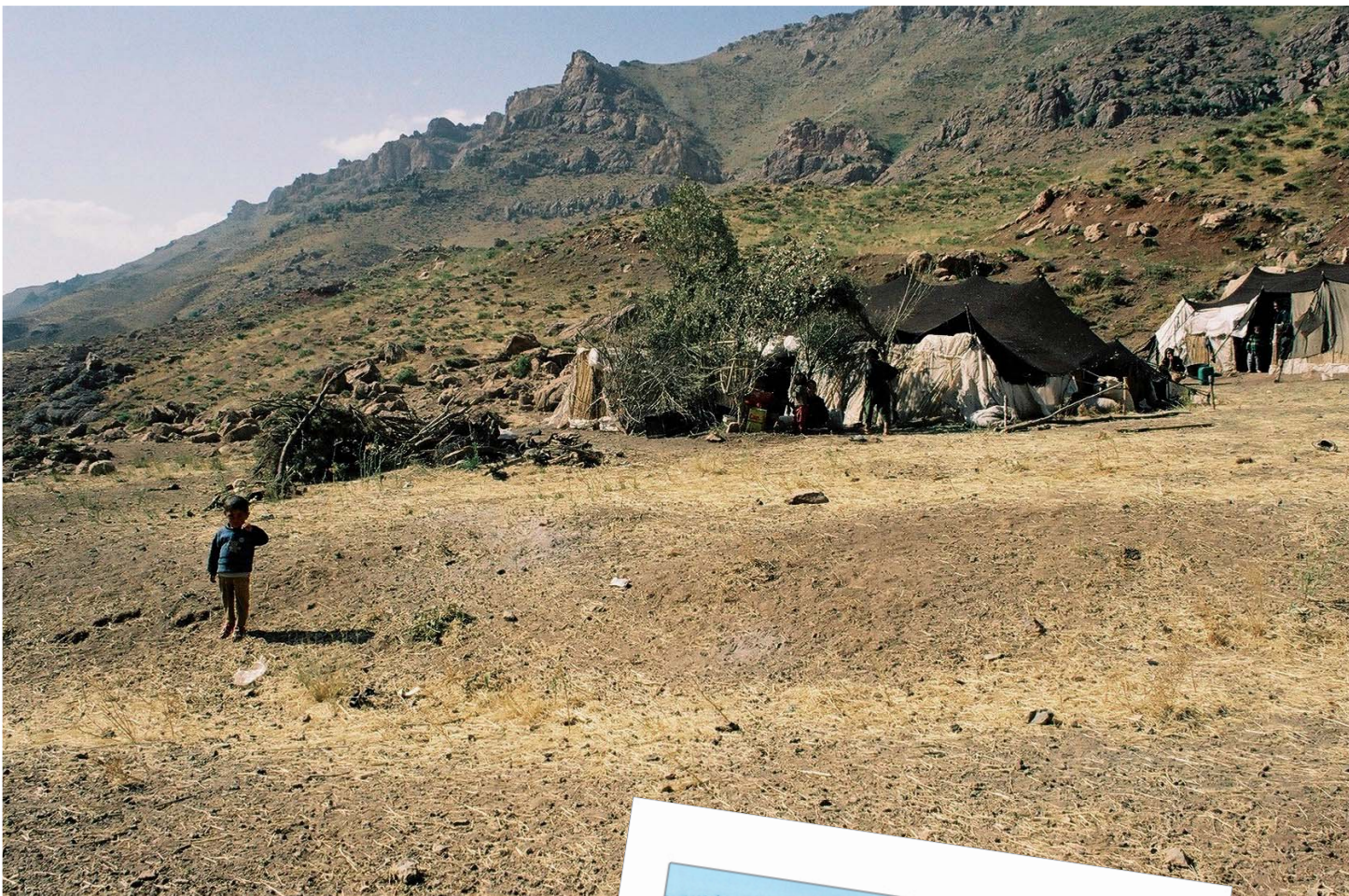
The civilian population is the principal beneficiary of humanitarian engagement with NSAs.

The above factors are meant to facilitate the analysis of engagement with NSAs on humanitarian or human rights norms. The following chapter discusses the findings of the two reports on NSA involvement in mine use and mine action, from which many of the listed observations were drawn.