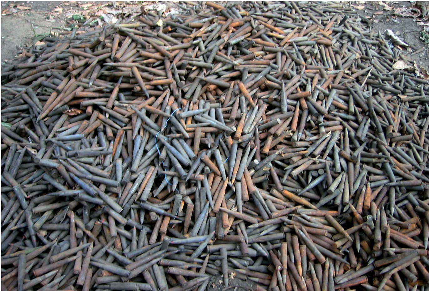
Ammunition rounds, South Sudan.

In this chapter, it has been shown that some of the findings from the NSAs and landmines project could also be useful for the study of NSA involvement in the small arms problem, both in negative (misuse) and positive (measures taken to improve protection or decrease misuse) terms. The following chapter summarizes the main findings of the report and presents some recommendations elaborated to improve mine action efforts with NSAs.