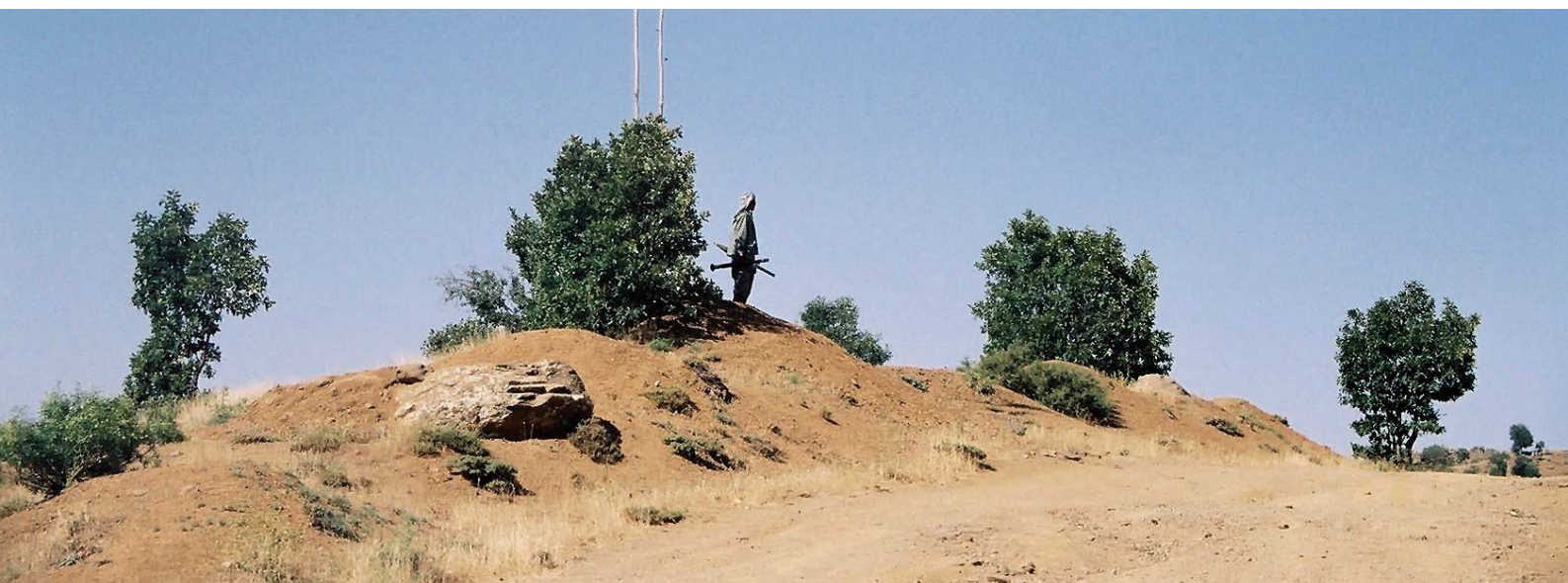
NSA soldier on watch.

There are numerous engagement options available: who should engage, how and with whom? 53 Different approaches for engagement have been identified, for example by Policzer and Capie, 54 Policzer and Manikkalingam, 55 the ICRC, 56 the International Council on Human Rights Policy, 57 and Conciliation Resources, 58 among others. Authors have identified the main actors that may be involved in engagement processes with NSAs as NGOs (humanitarian or human rights), 59 States or their different agencies, and international or regional organizations. 60 In 2000, David Petrasek created a framework for putting engagement with armed groups and questions of human rights violations in a wider perspective. The framework highlights the interconnectedness between the character of the armed group, the role of the host State, and the strengths and weaknesses of NGOs, 61 and recognized the need for different NGOs to take different approaches to armed groups, depending on their needs and the security situation of their collaborators. 62 He also identified three significant constituencies of NSAs that may have an impact on their behavior: local populations, refugee communities or internally displaced persons (IDPs), and diasporas. 63 Table 1 summarizes some of these approaches, actors and conditions, based on the above mentioned contributions.