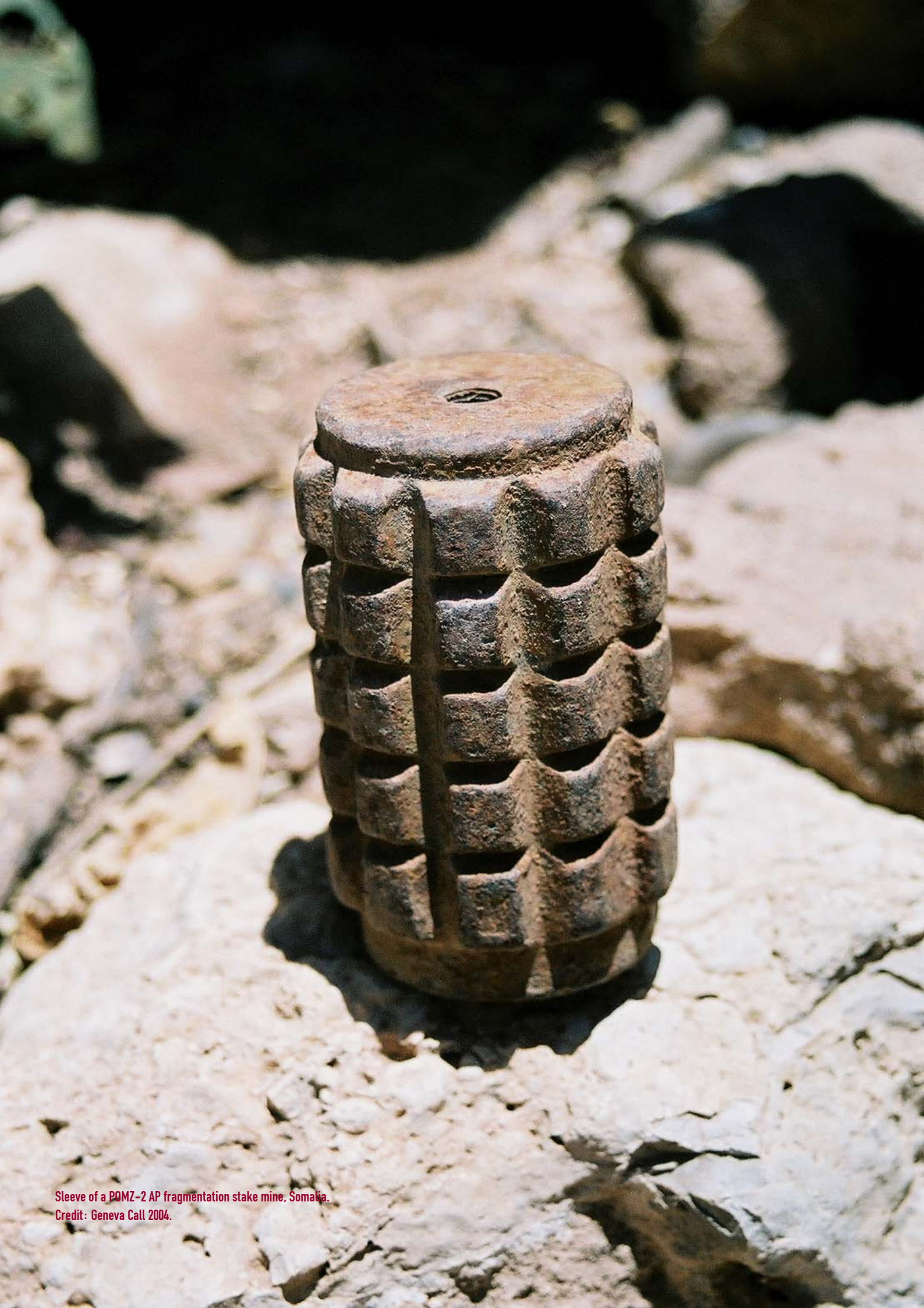
Sleeve of a POMZ-2 AP fragmentation stake mine, Somalia.