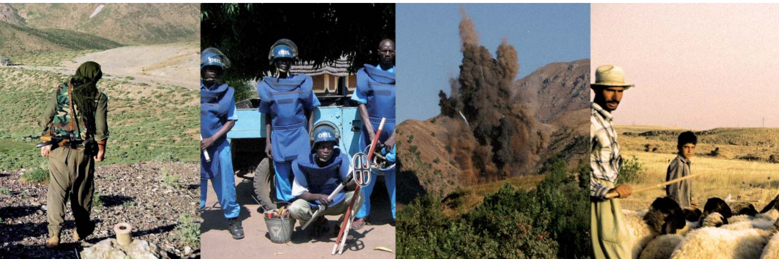
Geneva Call and the Program for the Study of International Organization(s), Geneva, 2007 ©