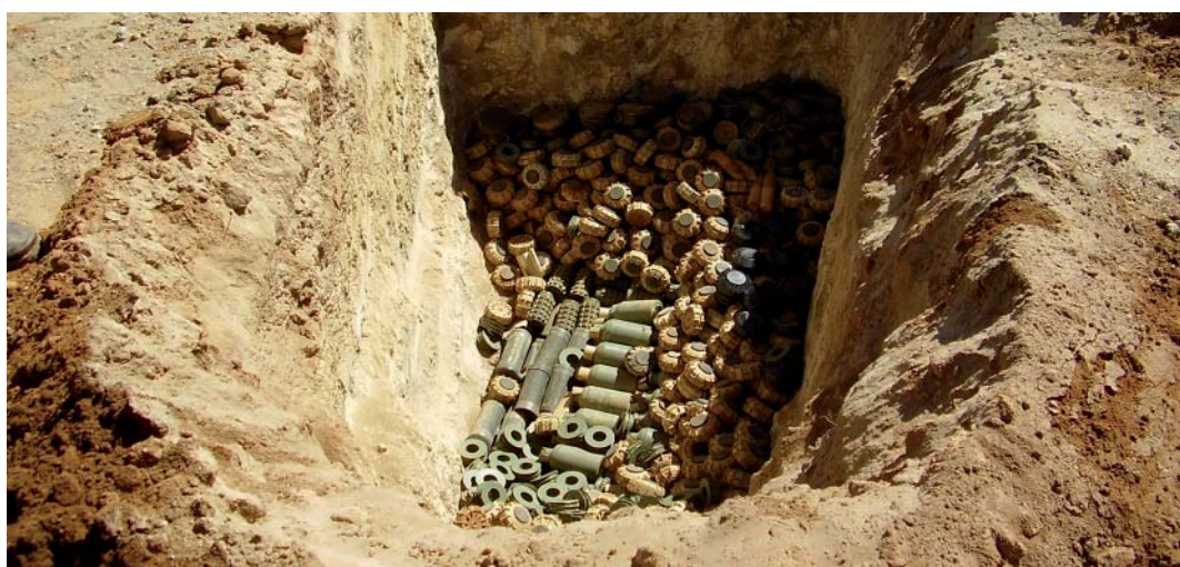
Mines belonging to an NSA, prepared for destruction.

The chapter that follows discusses how the findings here summarized could apply to other issues that constitute human security threats, exemplified by the issues of child soldiers and small arms and light weapons.